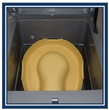
Stanbridge Bed Pans Capacity = 1 unit