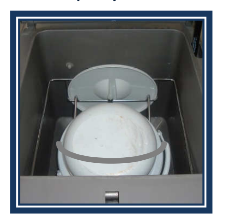
Commode Pot and Lid Capacity = 1 set