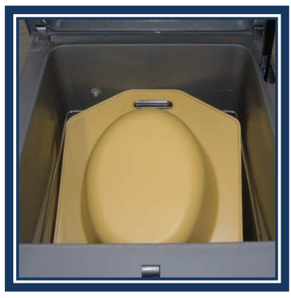
Stanbridge Commode Insert Pans Capacity = 1 unit