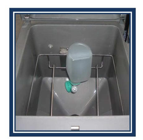
Urine Bottle Capacity = 1 unit

Only Stanbridge approved utensils should be used in the machine, incorrect utensils could result in inadequate cleaning disinfection. The machine could also become damaged due to incorrect loading which could affect your warranty