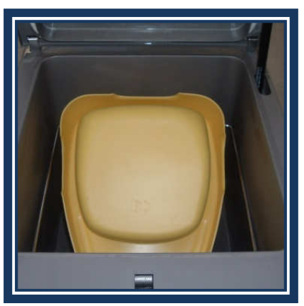
Stanbridge Slipper Pans Capacity = 1 unit

The washer/disinfector in this manual is intended to wash and disinfect the utensils shown on the Data Sheet – See below for correct loading applicable to the machine you have purchased.